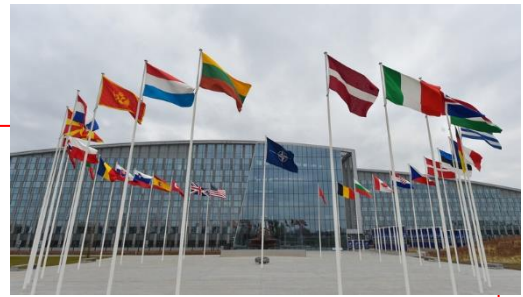
Nato's expansion since 1997