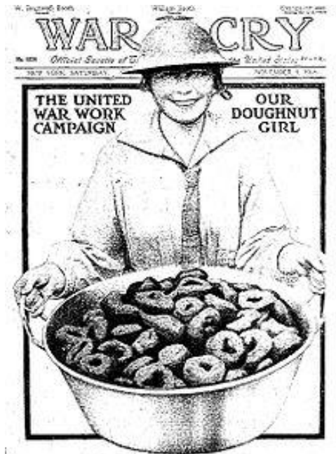
National Doughnut Day started in 1938 [1] as a fund raiser for Chicago's Salvation Army.