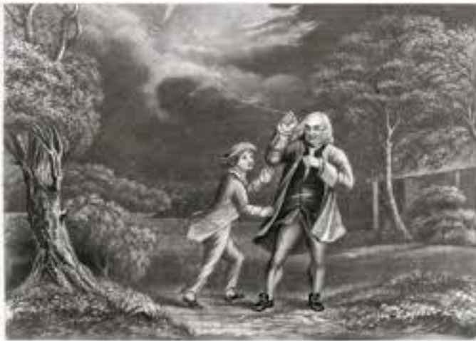
June 10, 1752 - Benjamin Franklin flies a kite in a lightening storm and discovers electricity.